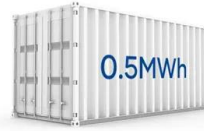
Standard 20ft containers

????????????????? macOS High Sierra 10.13.3??Office365 solo?Word?????16.9.1?? ????????? ?1?????? ?? ...