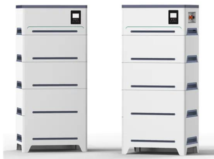
Reference and specifications Reference: 1000000000000000