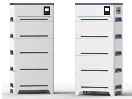
Reference and application Reference: 1000000000000000