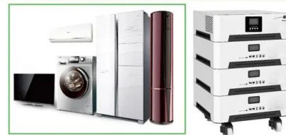
LPR Series 19' Rack Mounted